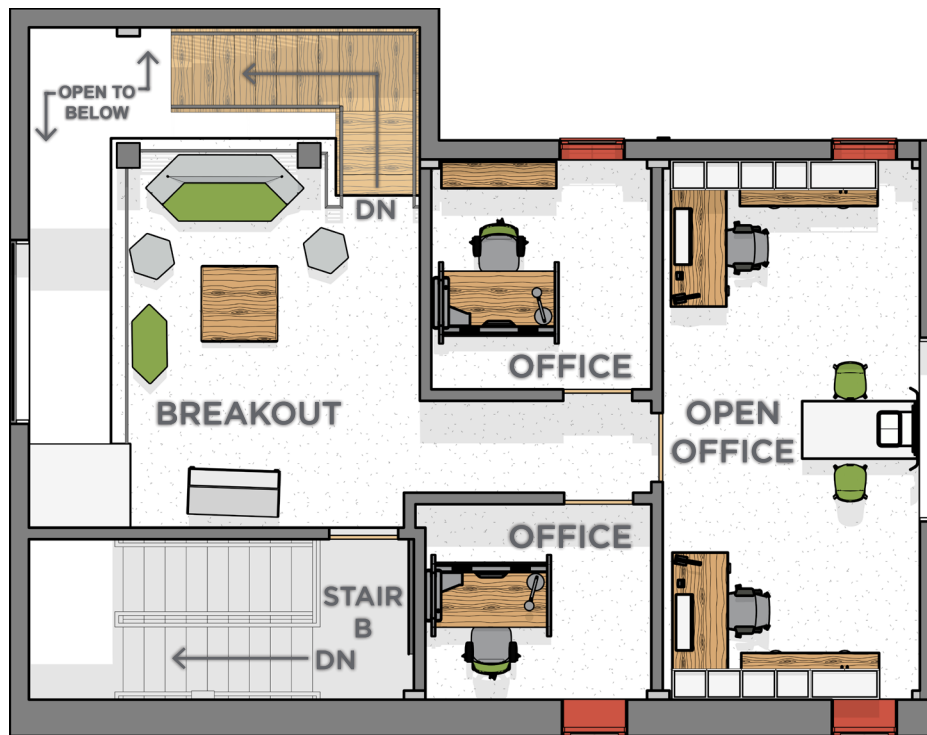
FLOOR PLAN : LOFT